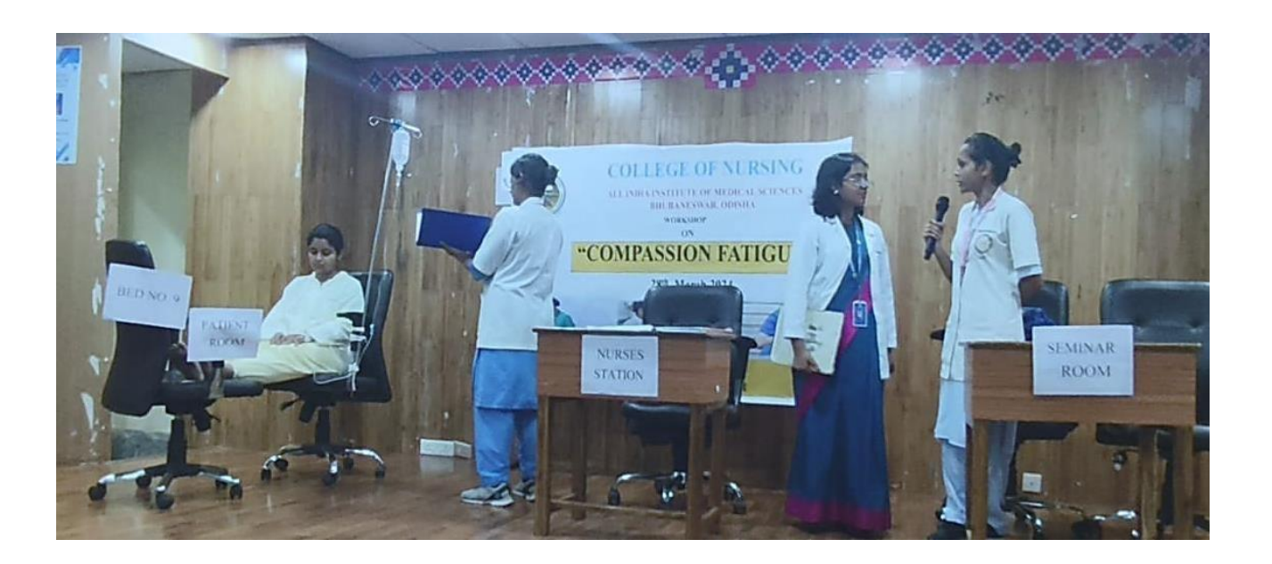
Around 45 Nursing Officers actively participated in the workshop and gained insight on the theme.

The workshop sessions covered topics such as Compassion Fatigue as a Component of Professional Quality of Life, Jeopardy and Roots of Compassion Fatigue, its Spectrum, Management, and Prevention Strategies. Activities throughout the day included insightful role-plays and engaging scenarios, such as "The Emotional Wheel" and other scenario-based activities. These interactive elements aimed to provide practical insights into recognizing and addressing compassion fatigue within the healthcare profession. A role play was performed by the MSc(N) 2<sup>nd</sup> year students related to the theme.